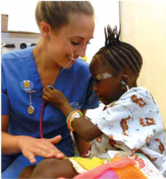
GLOBAL CITIZENSHIP In the Scottish Health Service The value of international volunteering