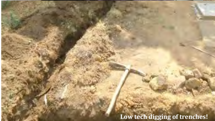
Low tech digging of trenches!